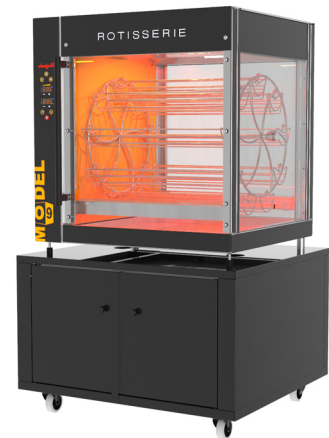
MODEL 9 WITH CUPBOARD AC 38