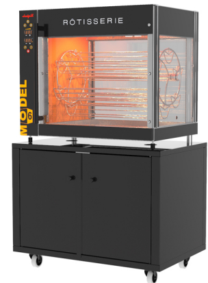
MODEL 6 WITH CUPBOARD AC 38